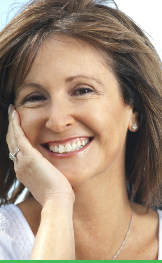
Sample benefits for resin-based composite fillings: