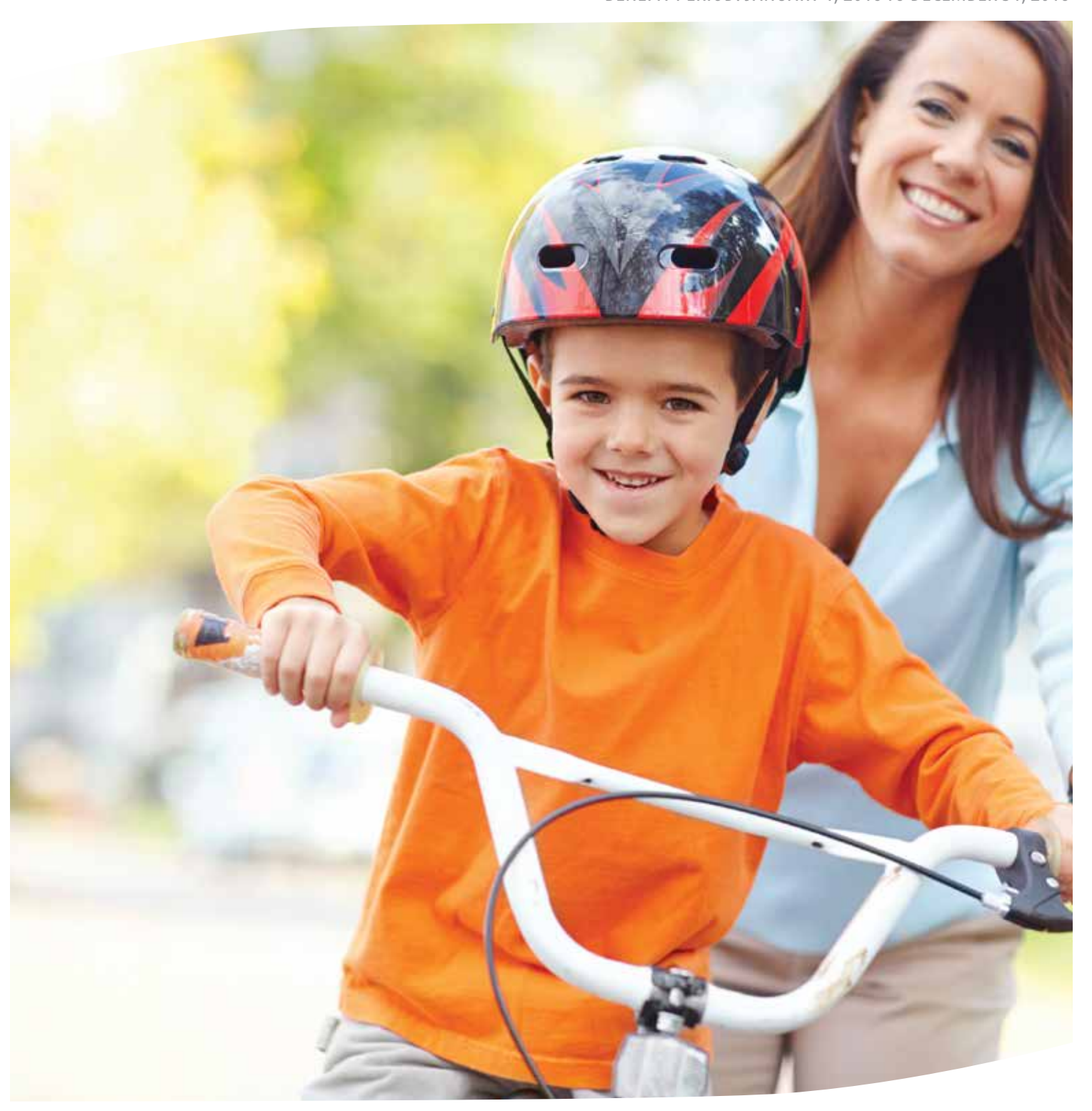
At Highmark West Virginia, we believe it's time to come together and make health care better.

BENEFIT PERIOD: JANUARY 1, 2016 TO DECEMBER 31, 2016